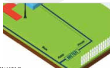
The public water line extends from, the main to the meter. The private water lines extend beyond the meter to the house.