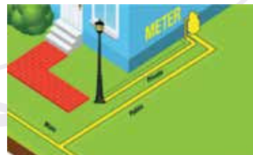
The public gas line extends from the main to the meter. The private gas line extends from the meter to the lamp post.